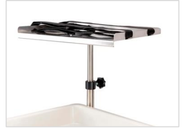
Stainless Steel Defibrillator Holder