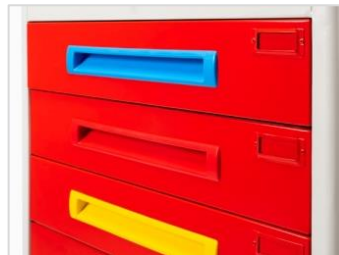
Identification Card Holder