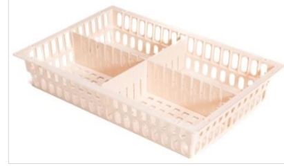
355 x 555 x 100(h) mm