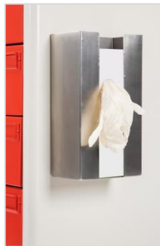
Glove Box Holder