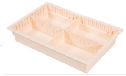
4 pcs 355 x 555 x 100(h) mm