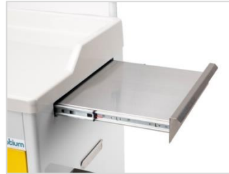
Stainless Steel Retractable Tray