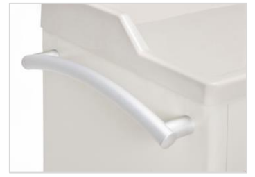
Ergonomic Pushing Handle

📍 Airport Industrial Zone Hidayet Street No:23 Oguzeli / Gaziantep / TURKEY