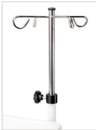
Stainless Steel IV Pole