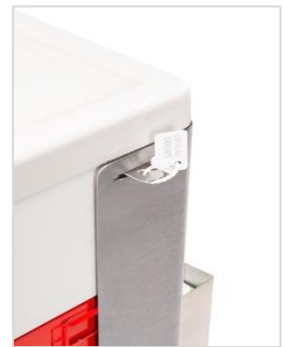
Break-away Seal System