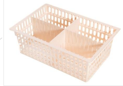
1 pcs 355 x 555 x 200(h) mm