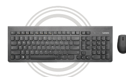
Lenovo 500 Wireless Combo Keyboard & Mouse

* Example of Lenovo catalogue naming convention