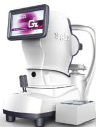
SINGLE LTL unite and printer