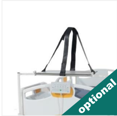
Monitor & Defibrillator Shelf