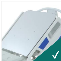
X-Ray Translucent HPL Backrest