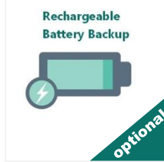
Rechargeable Battery Backup