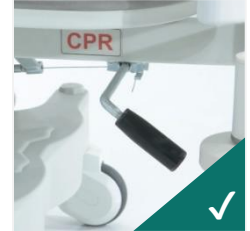
Dual Sided Manual CPR at Backrest