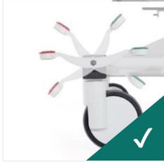
Central Brake Castors 150mm