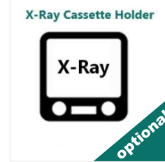
X-Ray Cassette Holder at Backrest