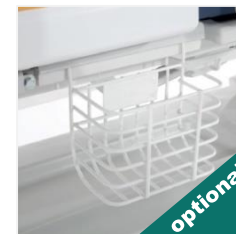
Urine Bag Basket