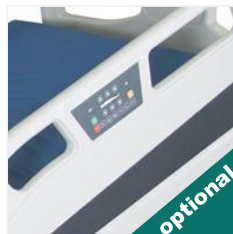
Control Panels Embedded on Side Rails