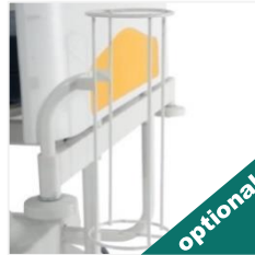
Oxygen Cylinder Holder