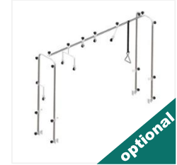
Orthopedic Traction System