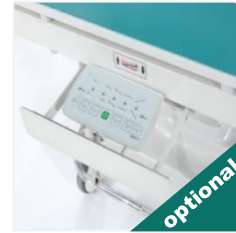
Nurse Panel Shelf