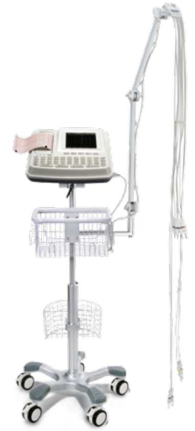
SE-601C With Rolling Stand (5.7" Color Touch Screen)