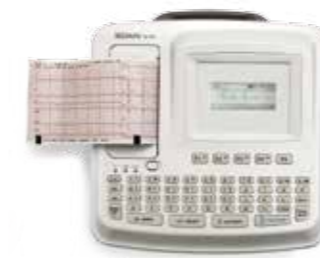
SE-601A (3.5" Monochrome LCD Display)