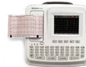
SE-601B (5.7" Color LCD Display)