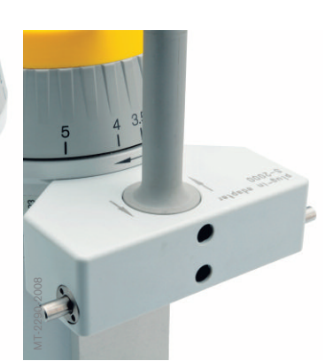
Plug-in S-2000 adapter with Interlock S