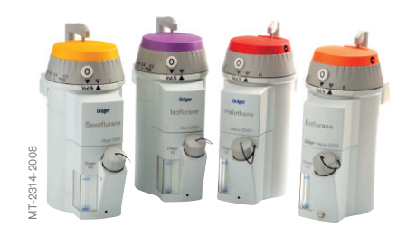
Dräger Vapor 2000 family.

Filling the Dräger Medical Vapor family is a quick and easy job and leaves no residual liquid left in the bottle. The newly designed "Dräger Fill" filling system without wearparts guarantees low life cycle costs and user-friendly handling.