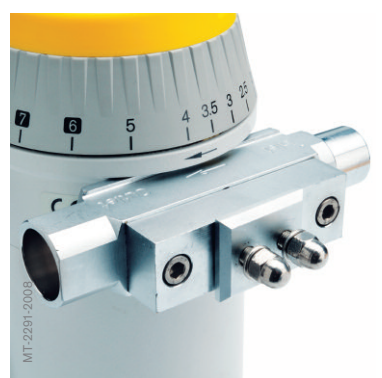
Conical connectors without Interlock system