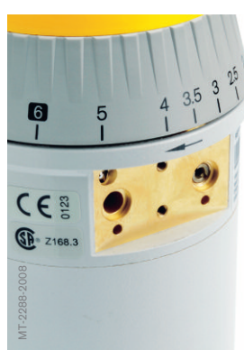
Permanent connection with the appropriate connector options (not shown)