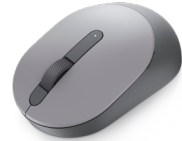
DELL MOBILE WIRELESS MOUSE | MS3320W

A dependable everyday companion providing eco-friendly quality protection and water-resistant protective coating for your device and other essentials.