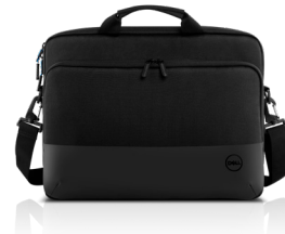
DELL PRO SLIM BRIEFCASE 15 | PO1520CS

With fast, high-power delivery of up to 65W/hr, this power bank can charge the widest range of USB-C® laptops and mobile devices.