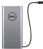
DELL USB-C NOTEBOOK POWER BANK 65W/65WHR | PW7018LC

Work seamlessly with dual-mode connectivity (2.4GHz wireless or Bluetooth) and 36 months of