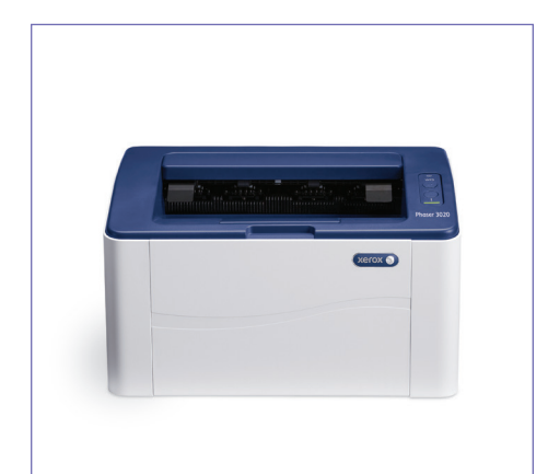
Phaser 3020. Print.