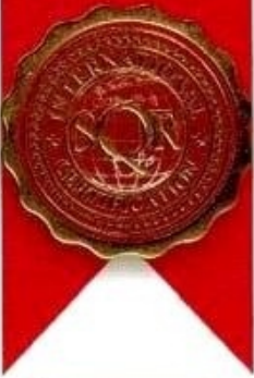
Belgelendirme Müdürü / Certification Manager

Belge NO / Certification Number : MTS-14090 İlk Kayıt Tarihi / Date of Initial Reg. : 29.05.2019 Basım Tarihi / Date of Certificate : 29.05.2025 Geçerlilik Tarihi / Date of Expiry : 28.05.2028 Yeniden Belgelendirme Tarihi / Date of Recertification : 28.05.2028