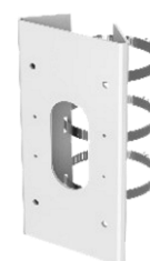
DS-1475ZJ-Y Vertical Pole Mount