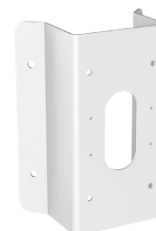
DS-1476ZJ-SUS Corner Mount