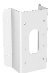
DS-1476ZJ-Y Corner Mount