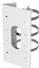
DS-1475ZJ-SUS Vertical Pole Mount