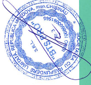
Eugene Kaspersky, Chief Executive Officer

A handwritten signature in black ink, appearing to read "Eugene Kaspersky".