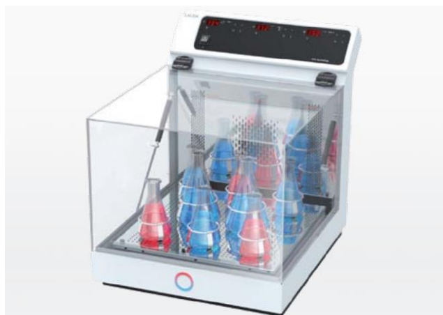
Varioshake VS 60 OI – compact, economic, powerful