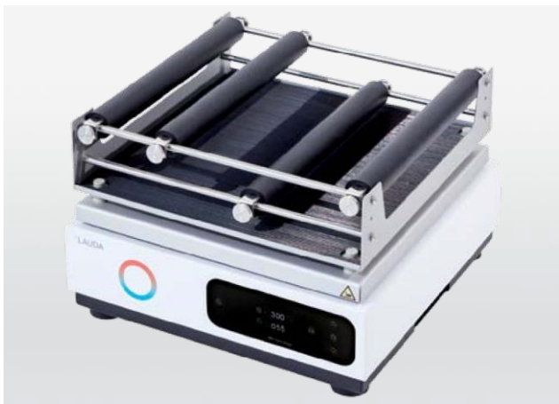
The robust entry-level shakers with digital controls – Varioshake VS 8 O and VS 8 B