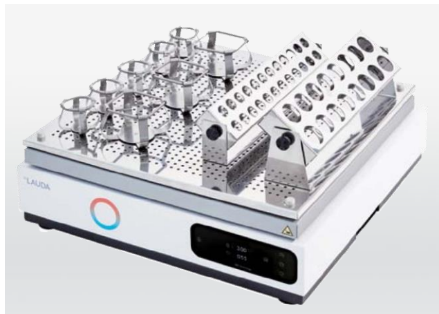
Modern digital controls and extended range of functions – Varioshake VS 15 O and VS 15 B