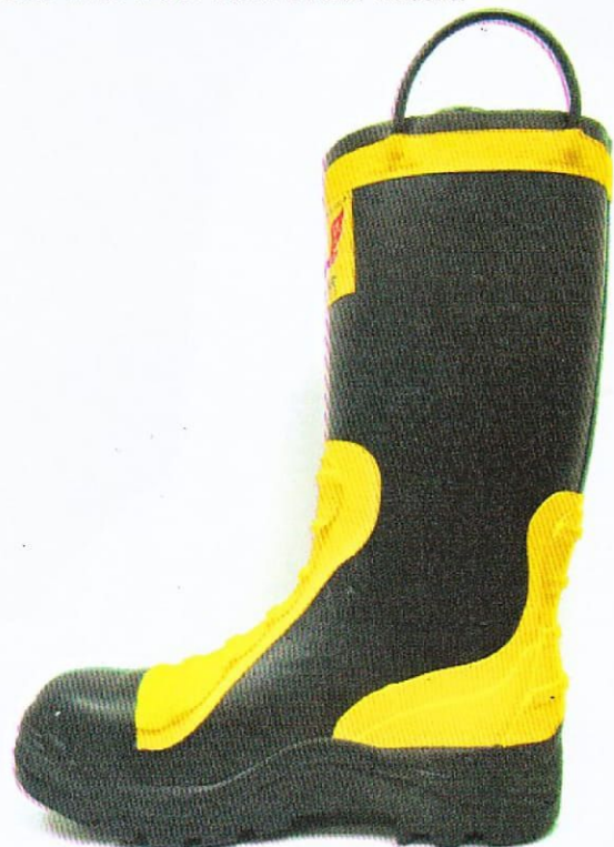
art. 81488, inner side