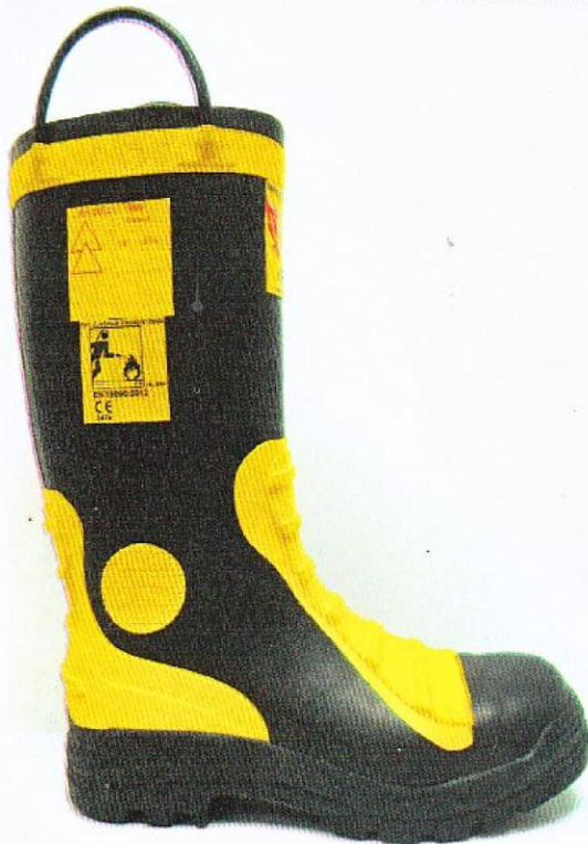
art. 81488, outer side

PPE description / appearance: Footwear is made of black and yellow rubber, without lining and without insock. Footwear with steel safety toecap and steel penetration resistant midsole, with black cleated rubber outsole. Footwear can be supplied with wool boot-sock / insert.