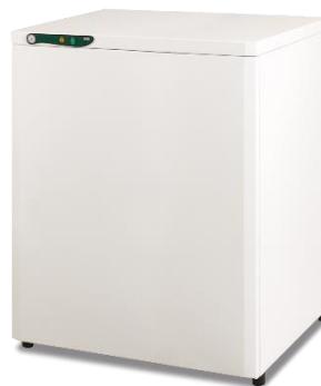
S50 DK50 2V/50S