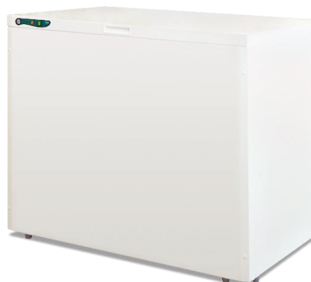
S110 DK50 2x2V/110S