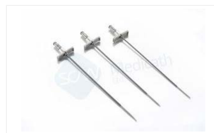
Peelable Introducer Sets