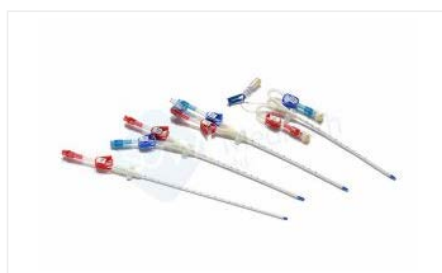
Hemodialysis Catheterization Kits