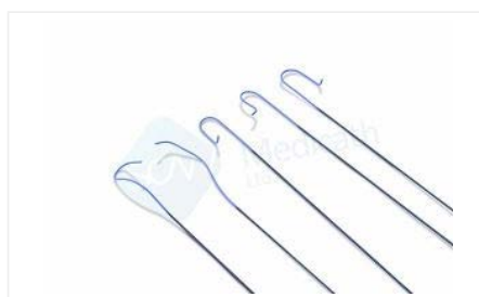
Radiology Angiographic Catheter