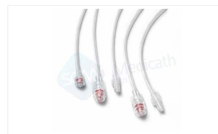
High Pressure Tubing