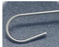
"J" Tip Nitinol Guidewire