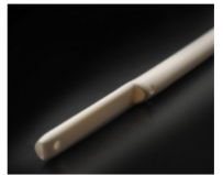
Long Term Hemodialysis Catheter