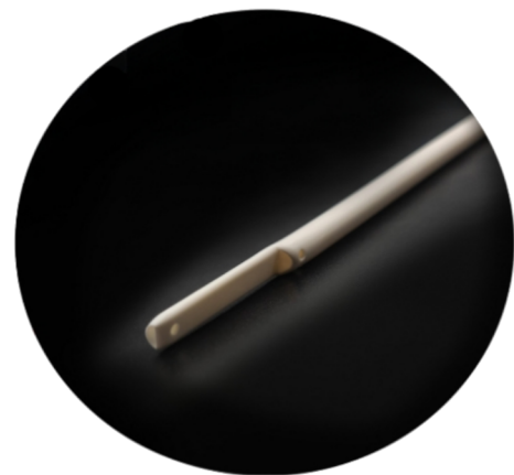
OPTIMA II have a special STEP TIP design

OPTIMA II Long term Hemodialysis Catheters has special Polyester Cuff Material to provide an easy & secured tunneled anchoring on patient"