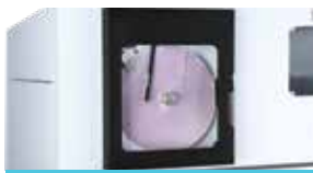
OPTIONAL GRAPHICAL CHART RECORDER