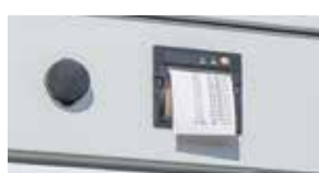
OPTIONAL THERMAL PRINTER