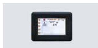
OPTIONAL TOUCH SCREEN DISPLAY