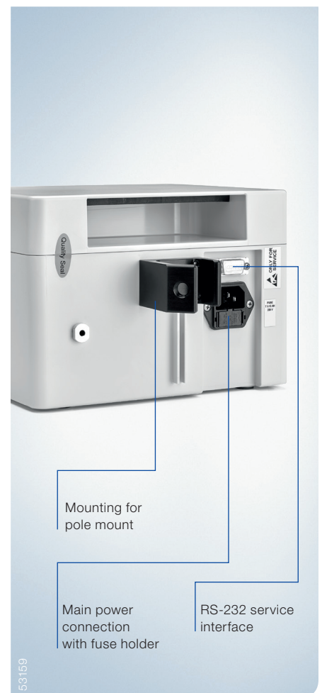
Rear view of the pump