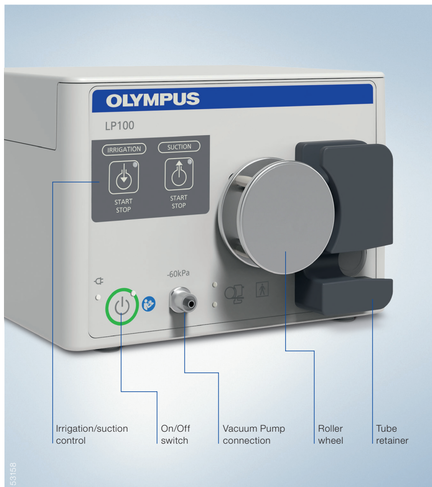
Front view of the pump

The laparoscopic pump complies with CE regulatory requirements.