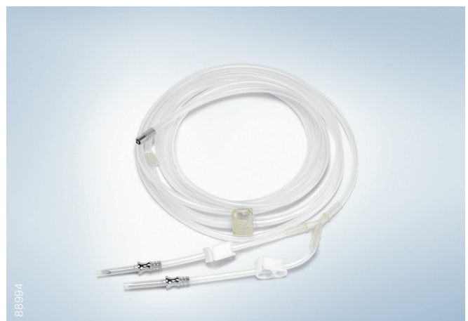
Tube set for irrigation, reusable