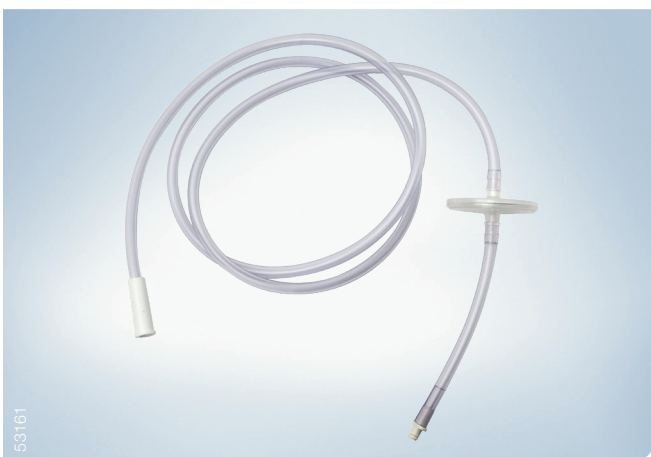
Vacuum tube set, incl. filter