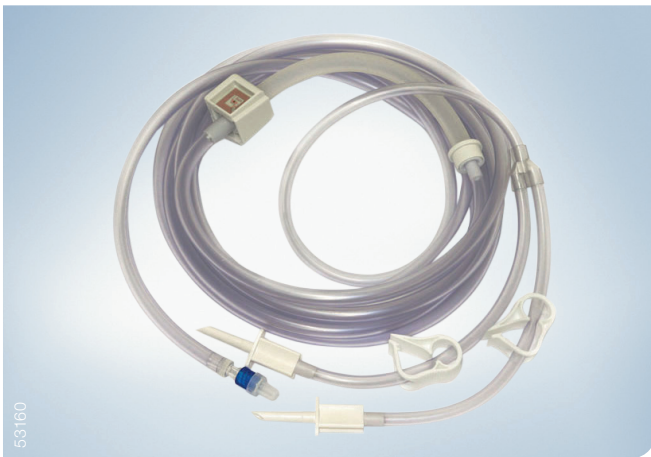
Tube set for irrigation