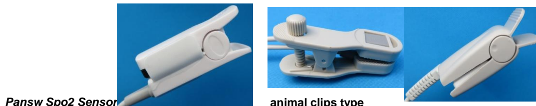
Pansw Spo2 Sensor