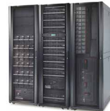
Symmetra PX 96 with power distribution and 6 minutes of runtime (PF=1)