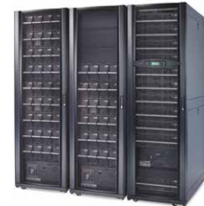
Symmetra PX 160 with 6 minutes of runtime (PF=1)