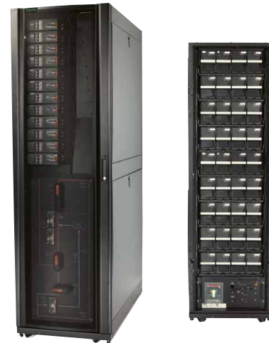
3-in-1 modular power distribution, maintenance bypass, and battery cabinet