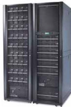
Symmetra PX 96 with 6 minutes of runtime (PF=1)