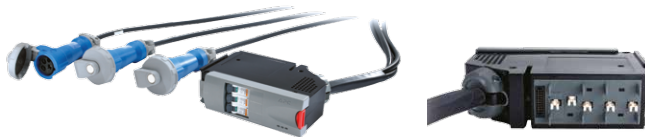
Factory-assembled and -tested power distribution modules feed power to IT racks