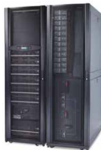
Symmetra PX 96 with power distribution and 6 minutes of runtime (PF=1)