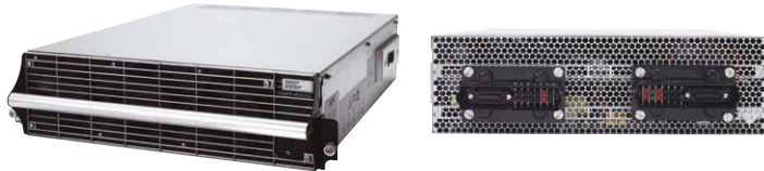
16 kVA/kW power modules provide high efficiency even at low load levels