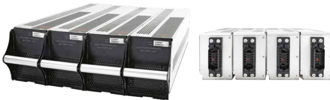
Modular batteries provide reduced MTTR, scalable runtime, and battery monitoring at the individual module level