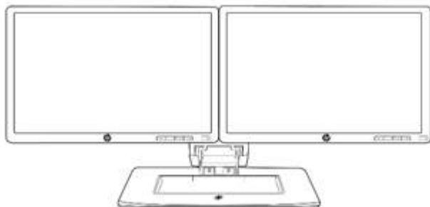
HP ProDisplay P240va and HP Adjustable Dual Display Stand dual monitor configuration shown. (Note: monitors and stands sold separately)

Your ideal office configuration begins with two HP ProDisplay P240va monitors combined with an HP Adjustable Dual Display Stand (AW664AA) for a small footprint, high productivity work solution.*