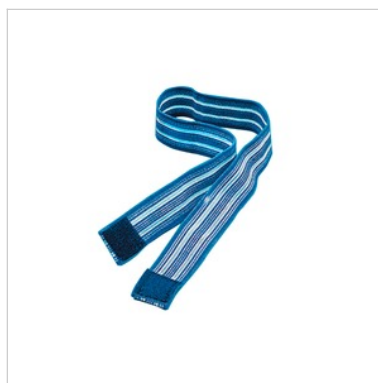
EL13013 ELASTIC STRAPS 60X3 H CM, 20 PCS

Electrodes, 6 x 8.5 cm, set of 25 pieces. 2 mm.