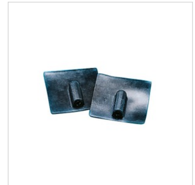
E17013 ELECTRODES, 5 X 5 CM, 2 PCS Electrodes 5 x 5 cm, set of 2 pieces. 2 mm.