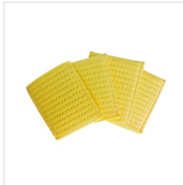
E0010 SPONGES 8 X 10 CM, 4 PCS Sponges 8 x 10 cm, 4 pieces