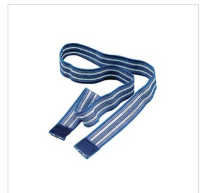
EL13014 ELASTIC STRAPS 100X3 H CM, 20 PCS

Elastic straps 60 x 3 cm, set of 20 pieces