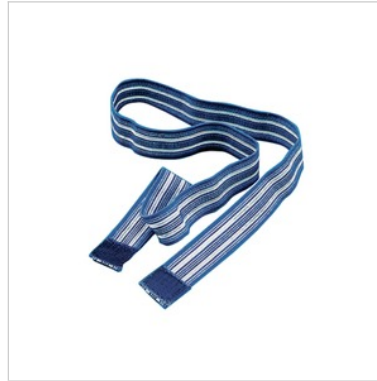
AC0667 ELASTIC BANDS 100X3 H CM Elastic band, cm 100x3