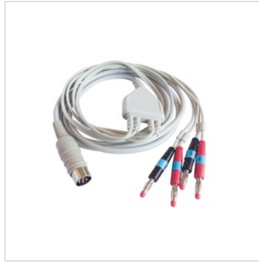
EL0194 OUTPUT CABLE

Trolley with a support surface designed for use with Chinesport table top electro-medical devices. Compact and easy to handle on 4 casters.