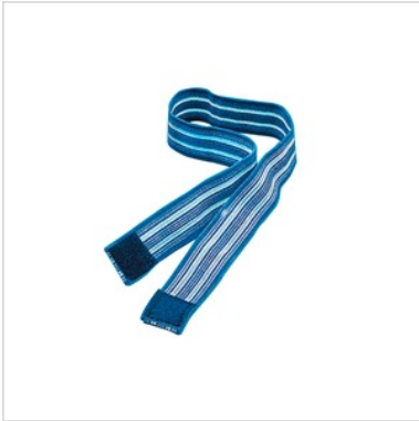
AC0665 ELASTIC BAND 60X3 H CM Elastic band, cm 60x3