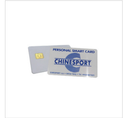
E0001 PERSONAL SMART CARD 10-pack to programme the patients' rehabilitation protocol, so as to facilitate and expedite the times of machine use.