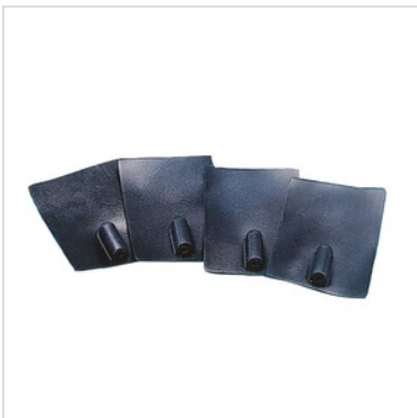
E17014 ELECTRODES, 6X8,5 CM, 4 PCS Electrodes, 6 x 8.5 cm, set of 4 pieces. 2 mm.