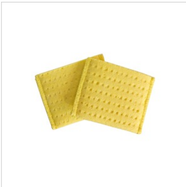
E0009 SPONGES 7 X 6, 2 PCS Sponges 7 X 6 cm, 2 pieces.