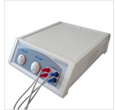
EL12004 VACUUM THERAPY

Additional 2-channel output cable. 2 mm.