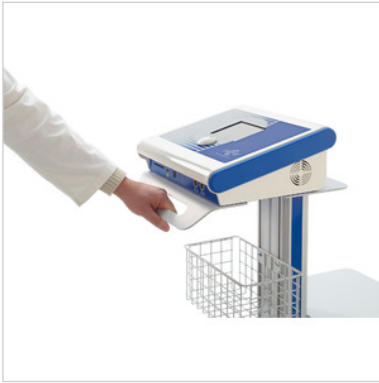
EL0191 WOK TROLLEY

Trolley with a support surface designed for use with Chinesport table top electro-medical devices. Compact and easy to handle on 4 casters.