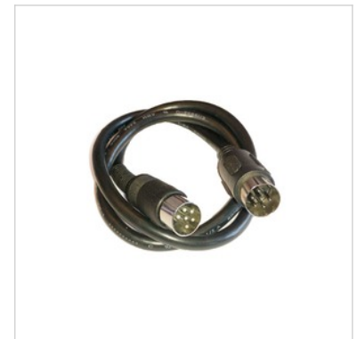
E0082 LINK CABLE Cable to connect electrotherapy and ultrasound machines.