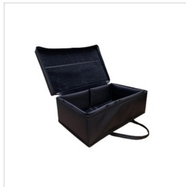
E0016 CARRY CASE Carry case for the unit transport