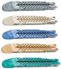
ECHELON 45mm Reloads -For use with all ECHELON 45mm Endoscopic Staplers