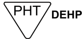
Figure 5: symbol for products which contain DEHP. Requirement as per EN 15986

Most of the available products today are non-DEHP . i.e. not made with DEHP. There are other plasticisers available such as TOTM (trioctyltrimellitate) which has a low release rate, shows hardly any toxicity in in-vitro studies with incubated hepatocytes and is therefore recommended as an alternative to DEHP. 16