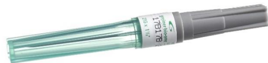
Figure 1: 21G VACUETTE® VISIO PLUS Needle with green translucent cap

It allows users to quickly choose suitable needle sizes by gauge, rather than by its actual metric size.