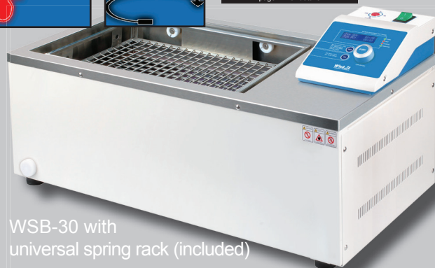
WSB-30 with universal spring rack (included)