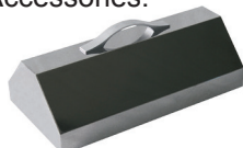
Dome lid for shaking water bath WSB