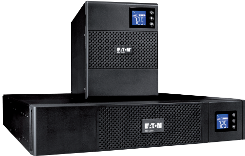
5SC is available in convenient compact form factors