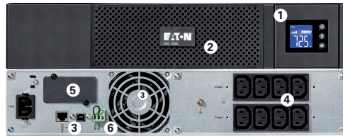
5SC 1500 Rack