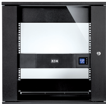
Short depth format for easy integration in small cabinets