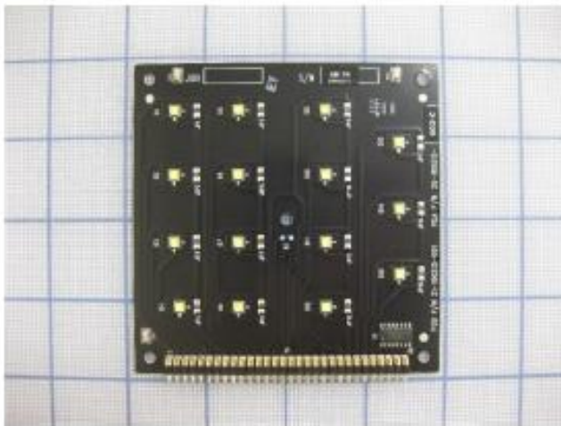
Fig. 1 OSRM027 load board example.