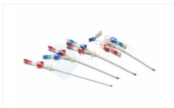
Hemodialysis Catheterization Kits