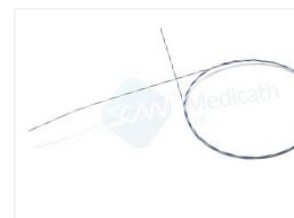
Zebra Guide Wires