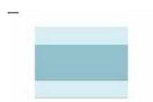
Table cover 150x190cm Abs.75x190cm Folded