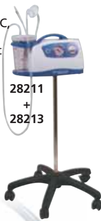
28211 + 28213

Flovac® autoclavable jars and disposable collection system: in addition to standard autoclavable jar, a disposable collection system is available, composed by a rigid reusable jar, a polyethylene disposable liner with hermetically sealed cover and hydrophobic, antireflux, antibacterial filter operating as an overflow valve.