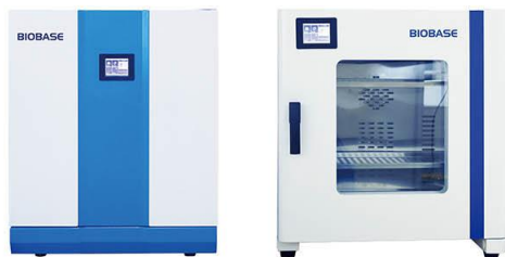
Double-layer Door (D type)