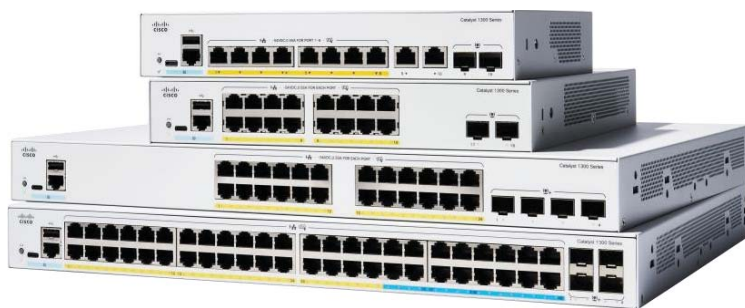
Figure 2. Cisco Catalyst 1300 Series switches

The Cisco Catalyst 1300 Series Switches are fixed, managed, enterprise-class Gigabit Ethernet Layer 3 switches designed for small and medium-sized business and branch offices. These simple, flexible, and secure switches are ideal for deployment out of the wiring closet. The Catalyst 1300 Series operates on customized Linux OS software, with an intuitive dashboard that simplifies network setup and advanced features that accelerate digital transformation, while pervasive security protects business-critical transactions. The 1300 Series switches provide the ideal combination of affordability and capabilities for small and medium-sized businesses and help you create a more efficient, better-connected workforce. When your business needs advanced networking features and security for the digital transformation, yet value is still a top consideration, you're ready for the Cisco Catalyst 1300 Series Switches.