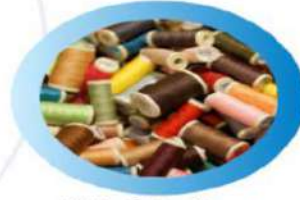
Wide Color Range