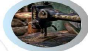
Years of Experience