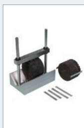
EN 12697-24 ANNEX ELVD Strip Mounting Kit