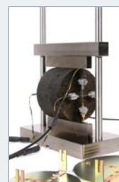
AASHTO T322/TP9, ASTM D7369, & NCHRP 1-28A APPENDIX 1