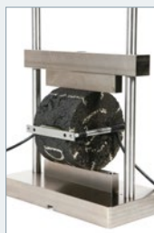
EN 12697-24 ANNEX E

Determination of the Resilient Modulus of Asphalt – Indirect Tensile Method