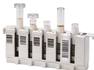
ARCHITECT Universal Sample Carrier

The benefits: equivalent patient results across all ARCHITECT i Systems