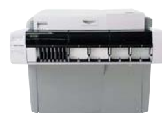
ARCHITECT i 2000SR

can be integrated with ARCHITECT c8000 and c16000 to consolidate clinical chemistry and immunoassay on a single platform.