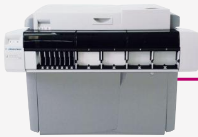
ARCHITECT i2000 SR

ARCHITECT i2000 SR can be integrated with the ARCHITECT c16000 to consolidate clinical chemistry and immunoassay on one platform.