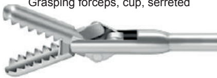
Grasping forceps, cup, serrated