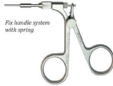
Biopsy Oval Cup Sharp