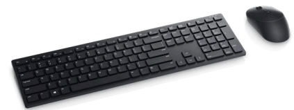
DELL PRO WIRELESS KEYBOARD AND MOUSE | KM5221W

A 23.8" monitor enhances your daily workflow. Featuring a height adjustable stand, Full HD resolution and integrated speakers in a space-saving design.