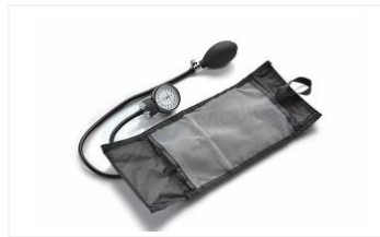
Pressure Infusion Bag