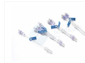
Infusion Set with Needle Adapters