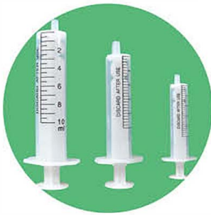
DMS-LS2 2-parts disposable syringe