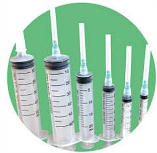
DMS-LL3 3-parts luer lock disposable syringe