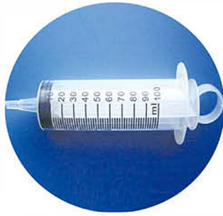
DMS-100CT 100ml catheter tip syringe