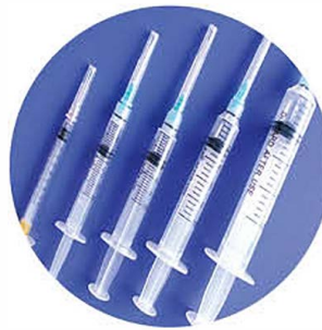
DMS-SSR safety syringe with retractable needle