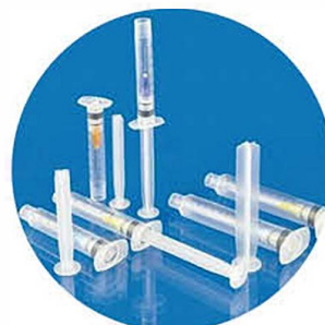
DMS-ADS Auto-destruct syringe