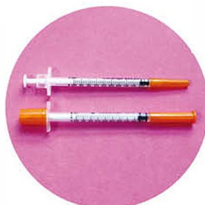
DMS-IS Insulin Syringe 0.3ml, 0.5ml, 1 ml