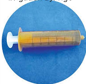
DMS-LSS Light-sensitive Syringe