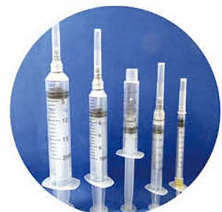
DMS-SS Safety syringe