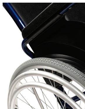
Hemiplegic (HEM2) version. Double rims to propel and to steer