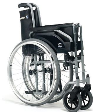
Easy to fold, easy to transport