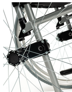
Amputee (AMP) version. Position of the rear wheel has shifted to the back