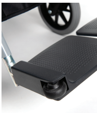
Aluminium footplates complete with rubber protection wheels