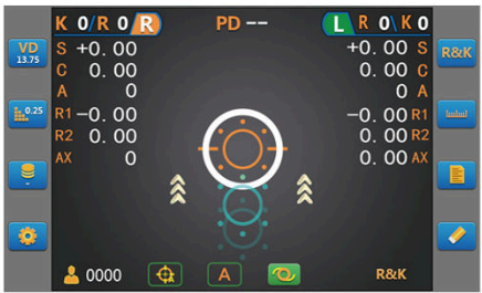
Auto tracking ( Y axis )

Adopt the ARM Cortex-A8 processor, which makes the measurement more faster and accurate. The touch screen provides friendly user interface, and makes the operation more convenient.