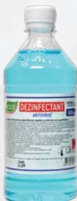
Farmol-Cid, 500 ml