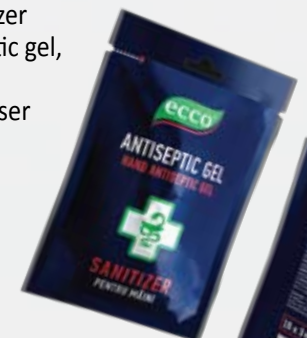
Hand sanitizer ECCO antiseptic gel, 20x3 g, single dose