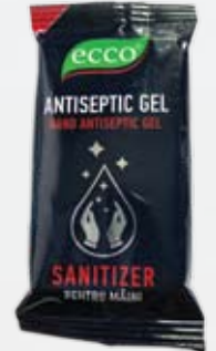
Hand sanitizer ECCO antiseptic gel, 35 g