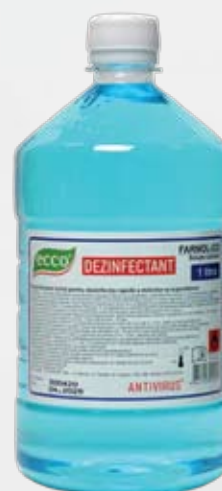
Farmol-Cid, 1 L