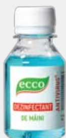
Farmol-Cid, 100 ml