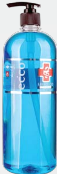
HOME Farmol-Cid, 1 L with dispenser