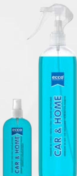
Air Freshener CAR & HOME ECCO COSMETIC® with a fresh citrus scent, 100 ml, 500 ml (Dior perfume)