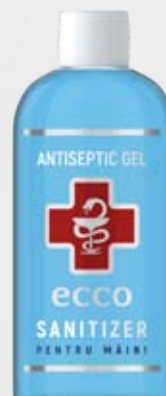
Hand sanitizer ECCO antiseptic gel, 100 ml