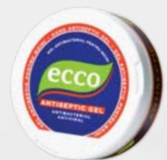
Hand sanitizer ECCO antiseptic gel, 35 g