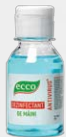
Farmol-Cid, 100 ml, flip top cover

The sanitizer is a ready-to-use solution.