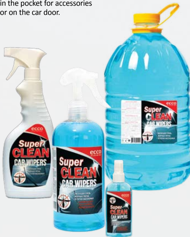
Car Glass Cleaner Spray ECCO CLEANING® 100 ml, 500 ml, 500 ml, 5 L

The compact form allows you to keep it close at hand - in the pocket for accessories or on the car door.