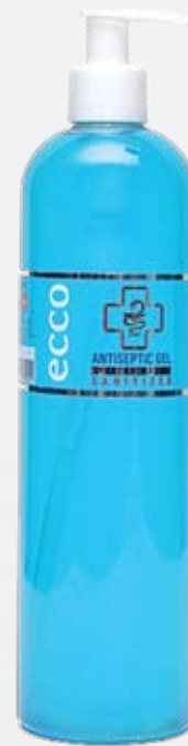
Hand sanitizer HOME antiseptic gel, 500 ml with dispenser