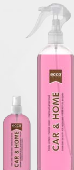
Air Freshener CAR & HOME ECCO COSMETIC® with a powdery-woody scent, 100 ml, 500 ml (Armani perfume)

The CAR & HOME Air Freshener is the perfect way to bring scent to every corner of your home and make every moment of your life special.