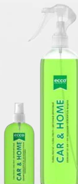
Air Freshener CAR & HOME ECCO COSMETIC® with a floral fruity scent, 100 ml, 500 ml (Dolce & Gabbana perfume)