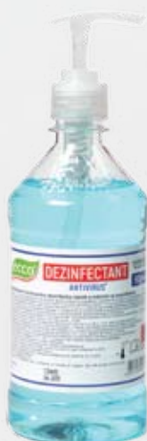
Farmol-Cid, 500 ml with dispenser