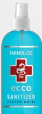
HOME Farmol-Cid, 100 ml, Spray