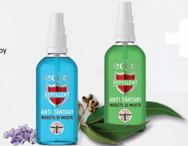
Protective spray ECCO® against mosquitoes and midges with natural essential oils of eucalyptus and lavender, 100 ml

Avoid contact with the mucous membranes of the eyes and mouth. In case of contact with mucous membranes, rinse with plenty of water. It is recommended to make essential oils tolerance tests before using the spray.