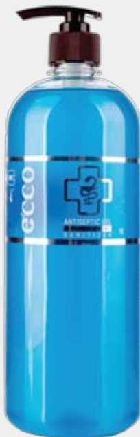
Hand sanitizer HOTEL antiseptic gel, 1 L with dispenser