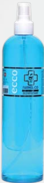
HOME Farmol-Cid, 500 ml, Spray