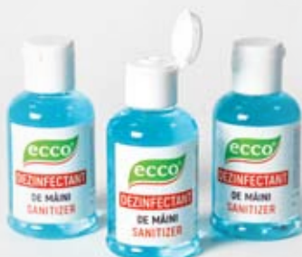
Farmol-Cid, 50 ml, flip top cover