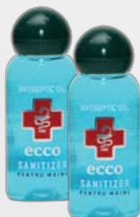
Hand sanitizer HOTEL antiseptic gel, 30 ml