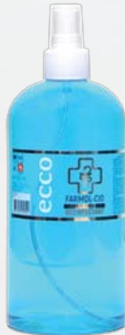
HOME Farmol-Cid, 500 ml, Spray