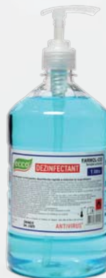
Farmol-Cid 1 L with dispenser