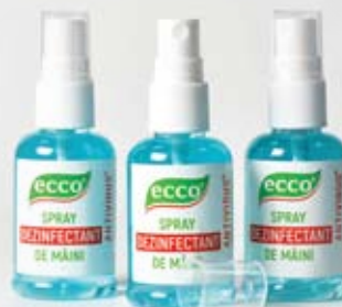
Farmol-Cid, 50 ml, Spray