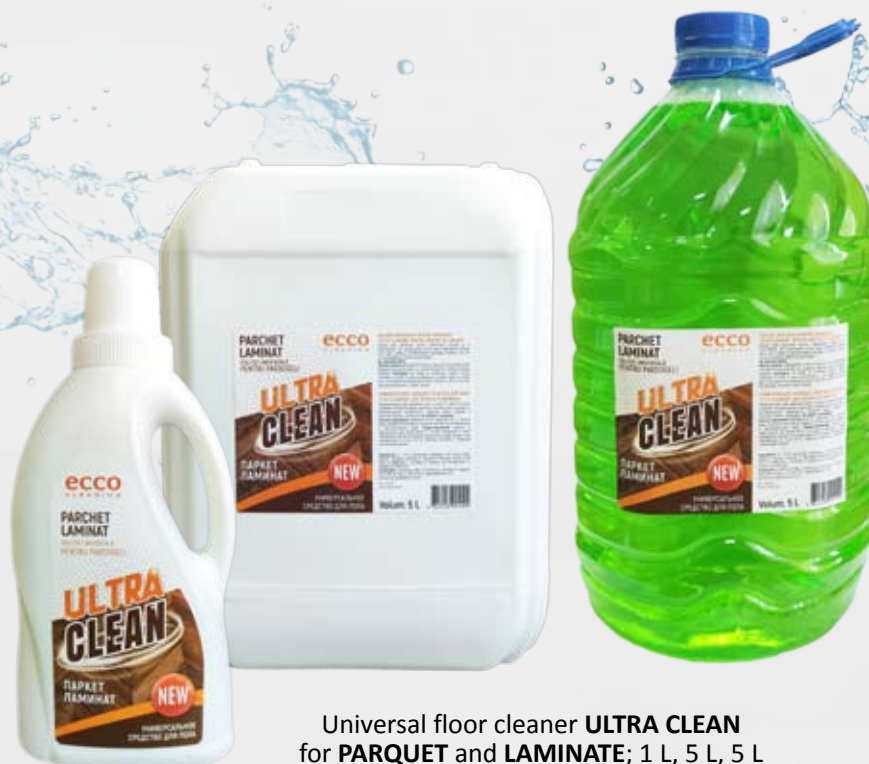
Universal floor cleaner ULTRA CLEAN for PARQUET and LAMINATE ; 1 L, 5 L, 5 L

ULTRA CLEAN floor cleaner is an excellent money-saving option for housewives. Cleaning will require a small amount of liquid; you will buy the product less often than a regular powder or gel. For daily cleaning using the maximum allowable concentration for washing, bottle weighting 1 liter will be enough for use for 1.5 months.