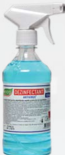
Farmol-Cid, 500 ml with trigger