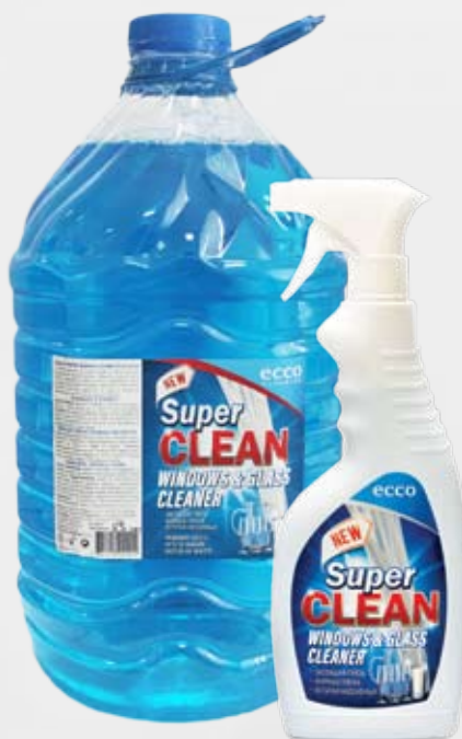
Glass and Glass Surface Cleaner ECCO CLEANING®, 5 L, 500 ml

With the Glass and Glass Surface Cleaner Spray ECCO CLEANING® you can clean less and manage to do more things.