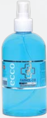
HOME Farmol-Cid, 350 ml, Spray