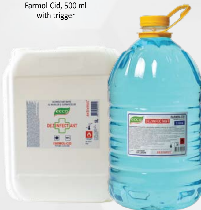
Farmol-Cid, 5 L