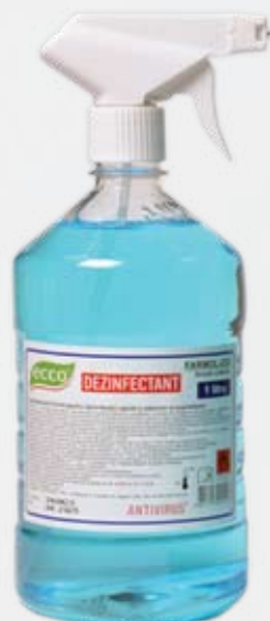
Farmol-Cid 1 L with trigger