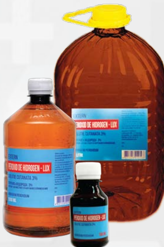
Hydrogen peroxide, 3% 100 ml, 1000 ml, 5 L