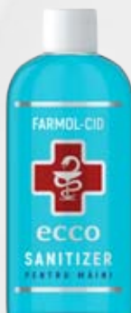
Farmol-Cid, 100 ml

«Farmol-Cid» — is intended for hygienic and quick treatment of hands and cleansing of various surfaces of daily activity, in domestic conditions of increased hygiene, where disinfection is the basic measure to prevent spread of infections by cleaning the hands of medical staff: