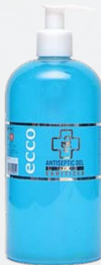
Hand sanitizer HOME antiseptic gel, 500 ml with dispenser