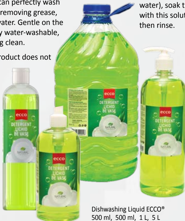
Dishwashing Liquid ECCO® 500 ml, 500 ml, 1 L, 5 L

Apply a small amount of the product on a sponge, foam it, wash the dishes with this foamy composition, then rinse with water. Or dilute the liquid with water (3-5 ml concentrated liquid + 1 liter of water), soak the dishes into a container with this solution, rub with a sponge, then rinse.