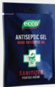
Hand sanitizer ECCO antiseptic gel, 10x3 g, single dose