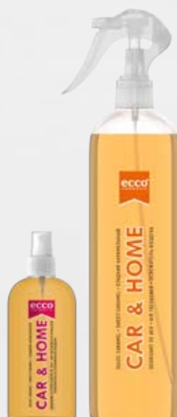
Air Freshener CAR & HOME ECCO COSMETIC® with a sweet caramel scent, 100 ml, 500 ml (Victoria's Secret perfume)