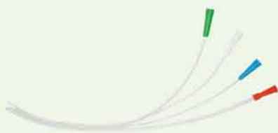
NRM1517 NELATON TUBE

Sizes: 6Fr-24Fr Female catheter also available