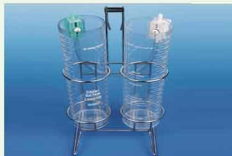
NRM1532 SUCTION CANISTER

Size: 1500ml,2000ml With or without filter