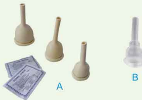
NRM1522 CONDOM CATHETER

Suction connection tube: ID 3/16", 1/4", 9/32" Length:1.8m,2.0m,2.5m etc Yankauer Handle: with crown or plain tip with or without control vent