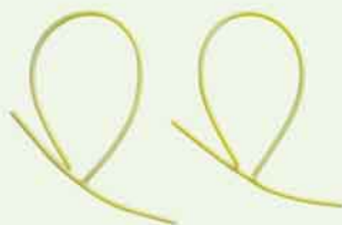
NRM1520 LATEX T-DRAINAGE TUBE