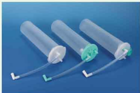
NRM1531 SUCTION LINER

A Type: Latex B Type: All silicone Size:S,M,L,XL PE or Peel packing