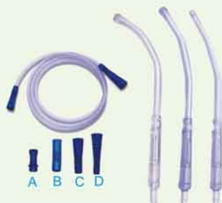
NRM1530 DISPOSABLE YANKAUER SET

Size: 3/8", 1/2", 3/4", 5/8", 1", 2" etc