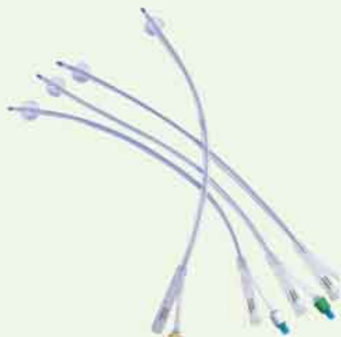
NRM1519 ALL SILICONE FOLEY CATHETER

One-way:red,8Fr-28Fr Two-way:6Fr-28Fr Three-way:16Fr-28Fr Soft or hard valve available