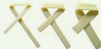
NRM1521 PENROSE DRAINAGE TUBE

Size: 3/8", 1/2", 3/4", 5/8", 1", 2" etc