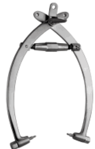
Crutchfield Skull F11-005 large type, cervical traction tongs-pins adjustable no drilling to be done 11cm