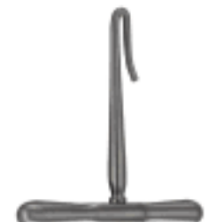
Gigle-Strully Handle for wire saw F11-018