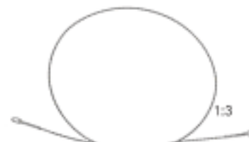
Gigle, Wire Saw F11-015 30cm 12" F11-016 40cm 16" F11-017 50cm 20" 6 wires twisted