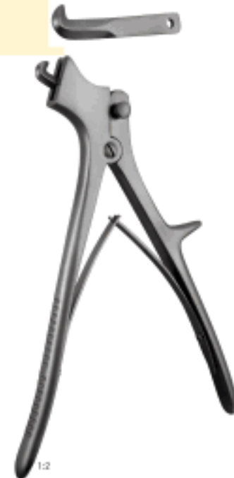
De Vibiss Skull Forceps F11-009 20cm 8 1/4"