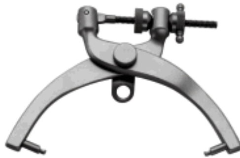
Crutchfield Traction Tongs F11-001 13cm small