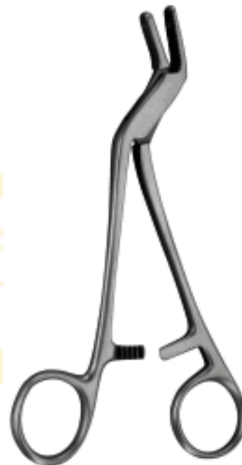
Adson Drill guide F11-008 15cm 6"