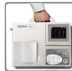
Portable Design (Handle Optional)