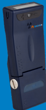
DMC 3000 Telemetry