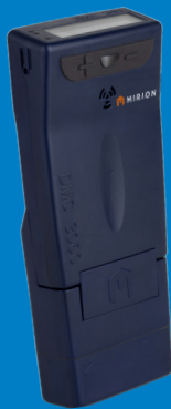
DMC 3000 Neutron