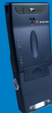
DMC 3000 Neutron Telemetry