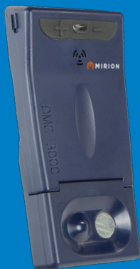
DMC 3000 Beta