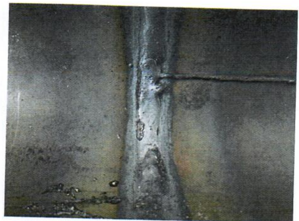
V352/17.1 – P1000245.JPG