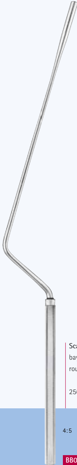
Scalpel handle, bayonet-shaped, round handle