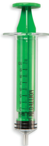
10ml, Dark Green K01-02025P