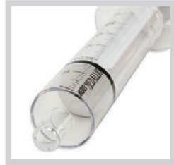
60ml, Toomey Tip MSS160TP