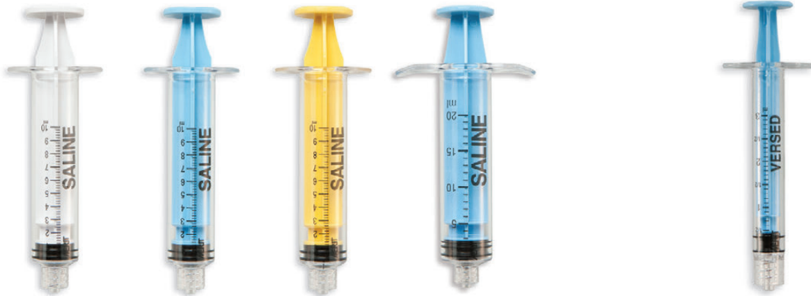
White, 10ml Light Blue, 10ml Yellow, 10ml Light Blue, 20ml, sword handle Light Blue K01-60075P K01-60083P K01-60099P K01-07192P K01-05185P

Barrel Material: Polycarbonate Tip Material: Silicone Plunger Material: ABS