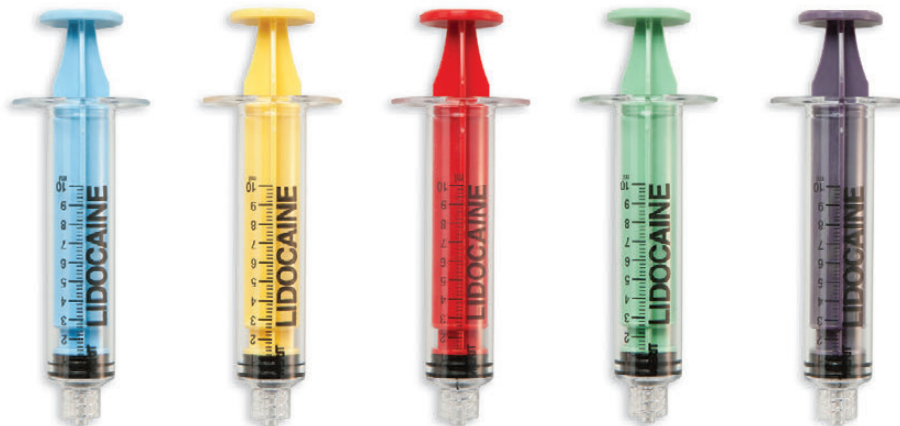
Light Blue Yellow Red Light Green Purple K01-60081P K01-60097P K01-60105P K01-60089P K01-04086P

Barrel Material: Polycarbonate Tip Material: Silicone Plunger Material: ABS