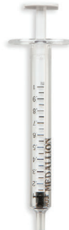
1ml, White K01-05235P