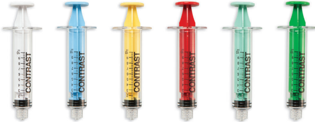
White Light Blue Yellow Red Light Green Dark Green K01-60078P K01-60086P K01-60102P K01-60110P K01-60094P K01-00786P

Barrel Material: Polycarbonate Tip Material: Silicone Plunger Material: ABS