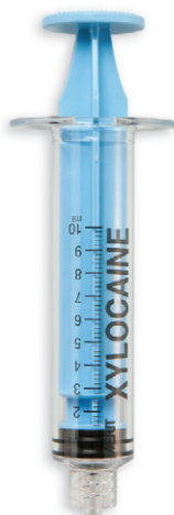
Light Blue K01-00917P

Barrel Material: Polycarbonate Tip Material: Silicone Plunger Material: ABS