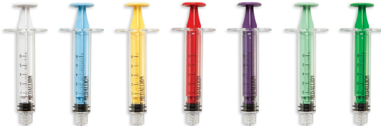
White Light Blue Yellow Red Purple Light Green Dark Green MSS061P MSS061-LBP MSS061-YP MSS061-RP MSS061-PRP MSS061-LGP MSS061-DGP

Barrel Material: Polycarbonate Tip Material: Silicone Plunger Material: ABS