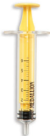
6ml, Yellow K01-02044P