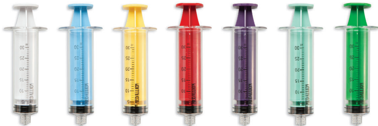
White Light Blue Yellow Red Purple Light Green Dark Green MSS131P MSS131-LBP MSS131-YP MSS131-RP MSS131-PRP MSS131-LGP MSS131-DGP

Barrel Material: Polycarbonate Tip Material: Silicone Plunger Material: ABS