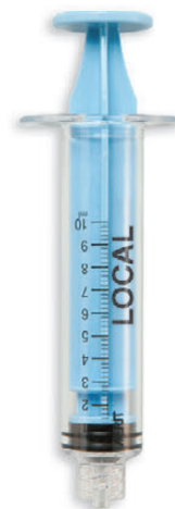
Light Blue K01-00981P