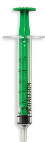
3ml, Dark Green K01-02040P

Barrel Material: Polycarbonate Tip Material: Silicone Plunger Material: ABS