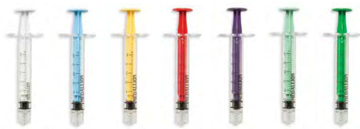
White Light Blue Yellow Red Purple Light Green Dark Green MSS031P MSS031-LBP MSS031-YP MSS031-RP MSS031-PRP MSS031-LGP MSS031-DGP

Barrel Material: Polycarbonate Tip Material: Silicone Plunger Material: ABS