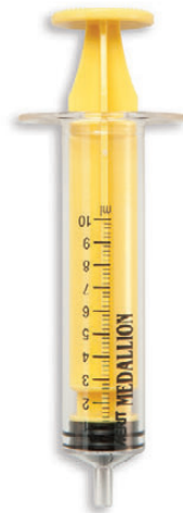
10ml, Yellow K01-60131P