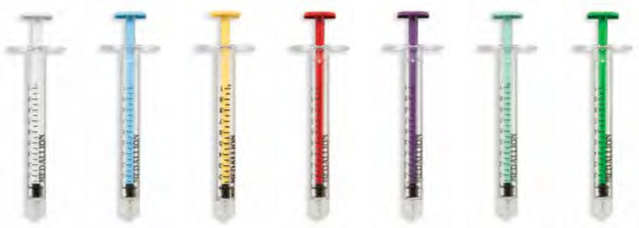
White Light Blue Yellow Red Purple Light Green Dark Green MSS011P MSS011-LBP MSS011-YP MSS011-RP MSS011-PRP MSS011-LGP MSS011-DGP

Barrel Material: Polycarbonate Tip Material: Silicone Plunger Material: ABS