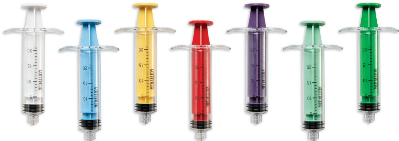
White Light Blue Yellow Red Purple Light Green Dark Green MSSW21P MSSW21-LBP MSSW21-YP MSSW21-RP MSSW21-PRP MSSW21-LGP MSSW21-DGP

Barrel Material: Polycarbonate Tip Material: Silicone Plunger Material: ABS