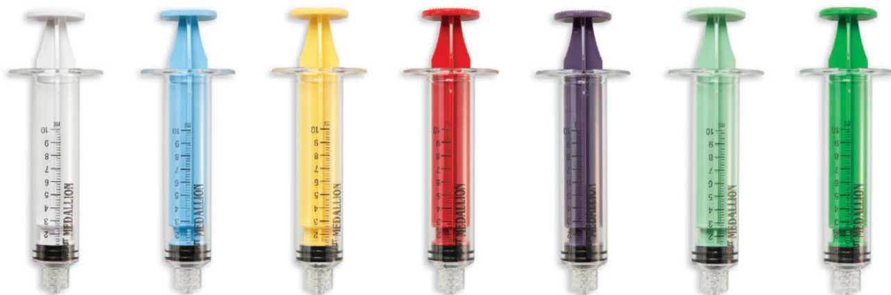
White Light Blue Yellow Red Purple Light Green Dark Green MSS111P MSS111-LBP MSS111-YP MSS111-RP MSS111-PRP MSS111-LGP MSS111-DGP

Barrel Material: Polycarbonate Tip Material: Silicone Plunger Material: ABS