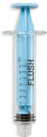
Light Blue K01-05093P

Barrel Material: Polycarbonate Tip Material: Silicone Plunger Material: ABS