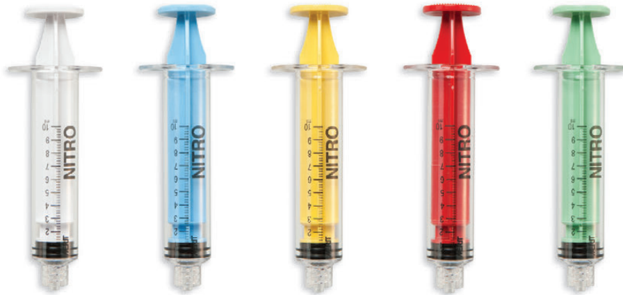
White Light Blue Yellow Red Light Green K01-60077P K01-60085P K01-60101P K01-60109P K01-60093P

Barrel Material: Polycarbonate Tip Material: Silicone Plunger Material: ABS