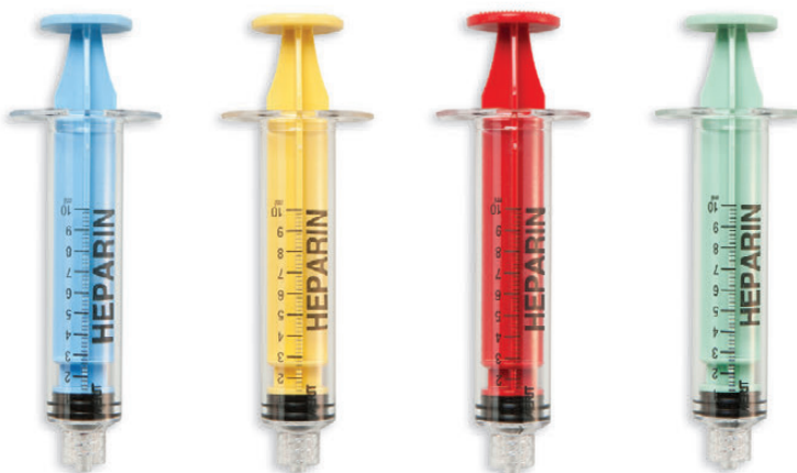
Light Blue Yellow Red Light Green K01-60082P K01-60098P K01-60106P K01-60090P

Barrel Material: Polycarbonate Tip Material: Silicone Plunger Material: ABS