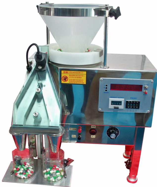
Electronic counting and filling machine YL-2A,